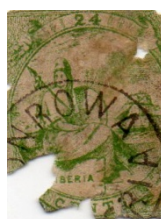
Liberia 1860 24c 2003 cat £32