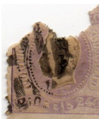
Portugal 240 reis 2003 cat £275