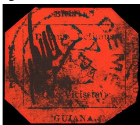
British Guiana 1856 1c When I saw it in New York in 2016, it looked even rougher than in this online photo from the net.

Whatever it is the stamp is not as perfect as might be desired... but, what happens when it looks like the truck did its thing and some clown from the post office scribbled on it and it just happens to be issued by British Guiana in 1856? In that case what looks like a space filler has the illustrious rank of the most expensive stamp ever sold when it went for over A$10 million in 2014. Now there is only one of them but there are a lot of other poorer cousins that maybe deserve a little more thought before being consigned to the bin.