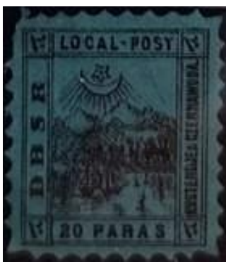
The Danube and Black Sea Railway (DBSR ) operated the Kustendje and Czerawoda local post in the late 1860s